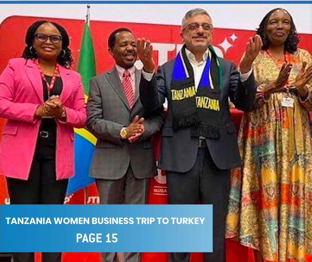
TANZANIA WOMEN BUSINESS TRIP TO TURKEY PAGE 15