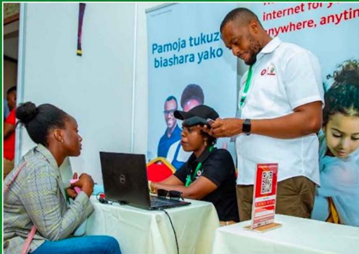
Officers from VODACOM attending to a participant of Tanzania Women in Business Annual Networking Forum about their total communications solutions catering to the business community.